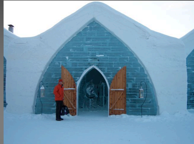
Stayed in the Ice Hotel!