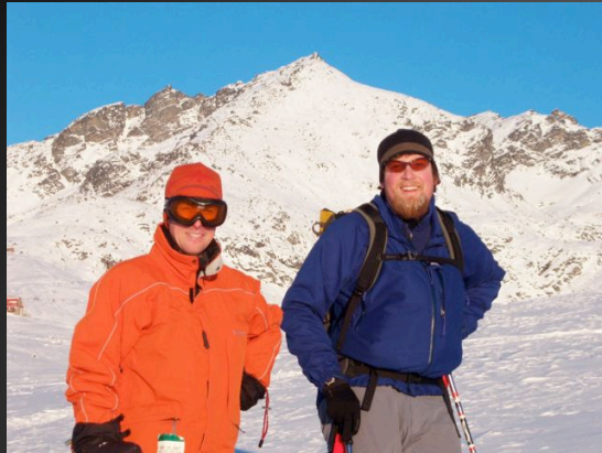
Telemark skiing in the Rockies