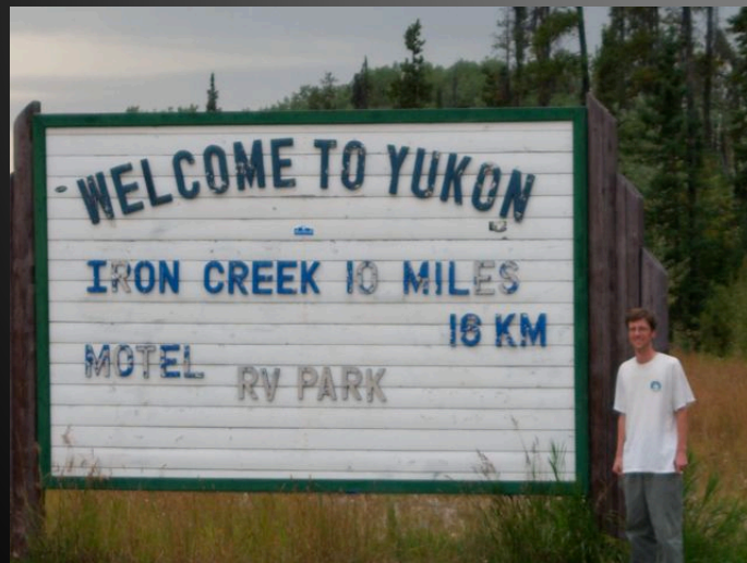
Caravanned to Alaska